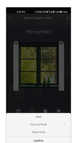
Working mode interface Morning mode: curtain on Night mode: curtain off

st position (The opening percentage of curtains) function